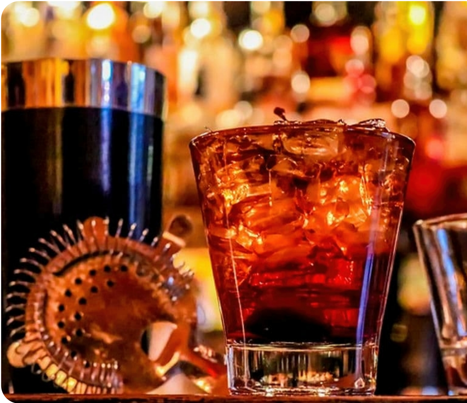
The challenges of navigating through Bartending World: Part-Time Versus Full-Time Roles

opportunities for bartenders, which contributes to a more robust and sustainable job market in the hospitality industry. Fort Worth's vibrant festival scene does more than enrich its cultural fabric but also contributes to the economy by supporting jobs in the bartending industry and wider hospitality industry. For bartenders in Fort Worth, these events are more than just occasions to celebrate; they are crucial components of their work lives.